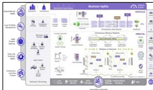
Figure 1.2: Framework for Scaling Software Development Teams

Scaling software development teams effectively is significant for organizations aiming to develop productivity and maintain quality across global projects. Managing cross-functional teams is compromising developers, testers, designers and DevOps professionals which requires strategic planning (Kuiper, 2019). Such as adopting agile methodologies that implement frameworks like Scrum or Kanban to develop flexibility and responsiveness.