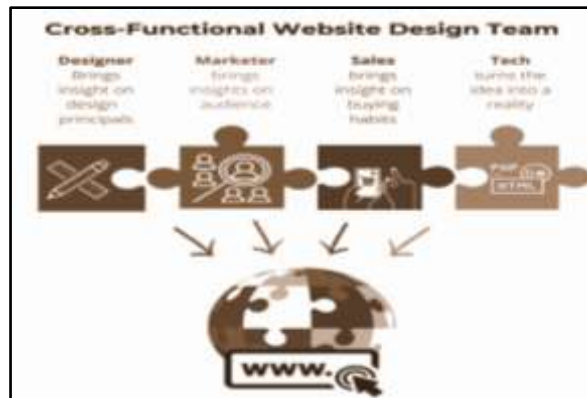
Figure 1.1: Cross-Functional Website Design Team

workflows and implementing best practices to maintain efficiency. Effecting scaling ensures a great level of opportunities for the companies because it helps them to progress their performances. Also, it requires addressing challenges such as communication gaps, cultural differences and time zone coordination to maintain well-functioning development ecosystems. Therefore, cross-functional teams in global software projects consist of individuals from different disciplines like developers, testers, UX designers and DevOps (West, 2018). Cross-functional teams foster innovation, problem-solving and adaptability by requiring efficient collaboration strategies and multiple localizations. The successful management of cross-functional teams provides effective communication tools and well-defined workflows that foster collaboration and accountability.